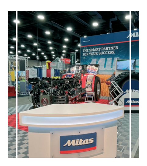
NATIONAL FARM MACHINERY SHOW KENTUCKY, USA FEBRUARY 16-19, 2022