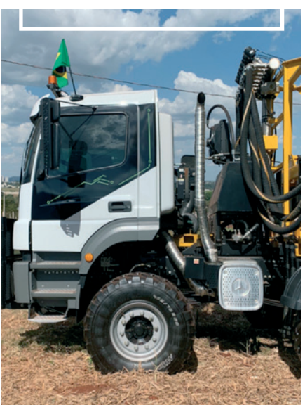
AGRISHOW BRAZIL APRIL 25-29, 2022