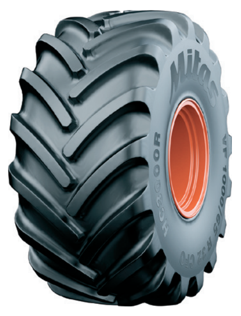
One of the new tires with the HC3000R tread pattern.

Mitas has significantly extended its High Capacity Municipal tire portfolio as three new sizes were released in 2019. One of them - the 650/65R42 IND 176A8/171D HCM TL - will be presented at Agritechnica. These tires are particularly suitable for municipal and roadmaintenance tractors, telescopic handlers and loaders and are designed for all-season use. The outstanding features of these tires include high durability thanks to their steel-belted radial construction, the unique design of the tread pattern in the central part, and exceptional traction characteristics thanks to more edges on the lugs. The HCM tires offer excellent self-